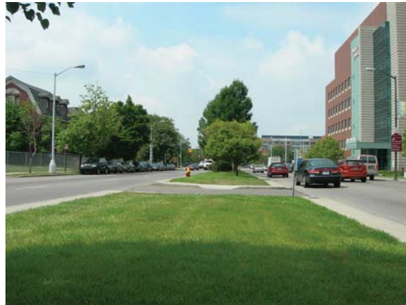
Figure 9. As automobile circulation in downtown Detroit increased, many downtown streets were widened or reconfigured to allow for easier traffic flow. Shown is Mack Avenue, an important east–west street.

clearance. As a result of density downtown and midtown, Manhattan experienced almost no street widening during the 20th century except where subways and tunnel entrances required it. Likewise, in San Francisco and Chicago, early plans for new downtown boulevards (Burnham and Bennett, 1904, 1909) remained mostly unbuilt because of the great expense of creating such roadways. But 20th-century Detroit experienced much street widening, straightening, and reconfiguration. Some rationalization occurred in association with highways and urban renewal. An additional 7 miles of 1896 block frontage were removed simply to widen major streets for the city's growing automobile traffic. Major streets