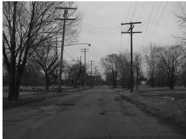
Figure 3. Much of today's desolate Detroit streetscape is the result of building clearances and block consolidation.

The query results of the digital model reflect the substantial urban design changes that occurred in downtown Detroit. Table 1 shows the principal block length totals in 1896 and 2002 together with