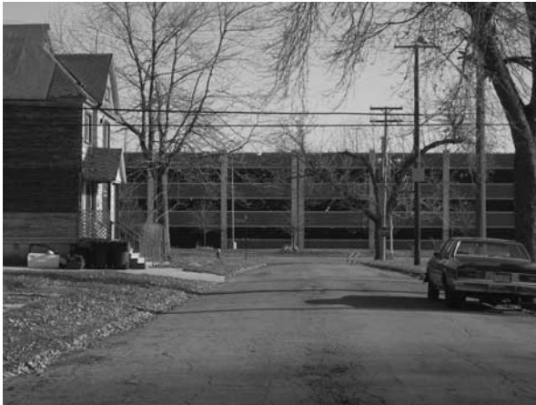
Figure 10. A variety of other forces, including parking structures, closed streets, combined blocks, and demolished older buildings during downtown Detroit's 20th century.

Almost half of the block frontage destruction in the 'indeterminate' category was caused by industrial uses. This is consistent with trends in industrial facilities in the post-war period, which required large, single-story buildings with abundant parking and loading facilities. Accommodating these facilities near Detroit's downtown required large-scale block clearance and consolidation analogous to that which occurred for urban renewal purposes. Additional significant causes of destruction were parking garages and lots, all of which were seemingly independent of other land uses, and public institutions such as schools and churches (Figure 10). Much of the latter block consolidation occurred in order to provide these uses with larger, campus-type sites containing additional parking, recreational, or open space facilities, and permitting them to emulate the space standards of suburban institutions. Together, these three types of land uses caused over 86% of the 'indeterminate' change – and approximately 17% of the total block frontage loss.