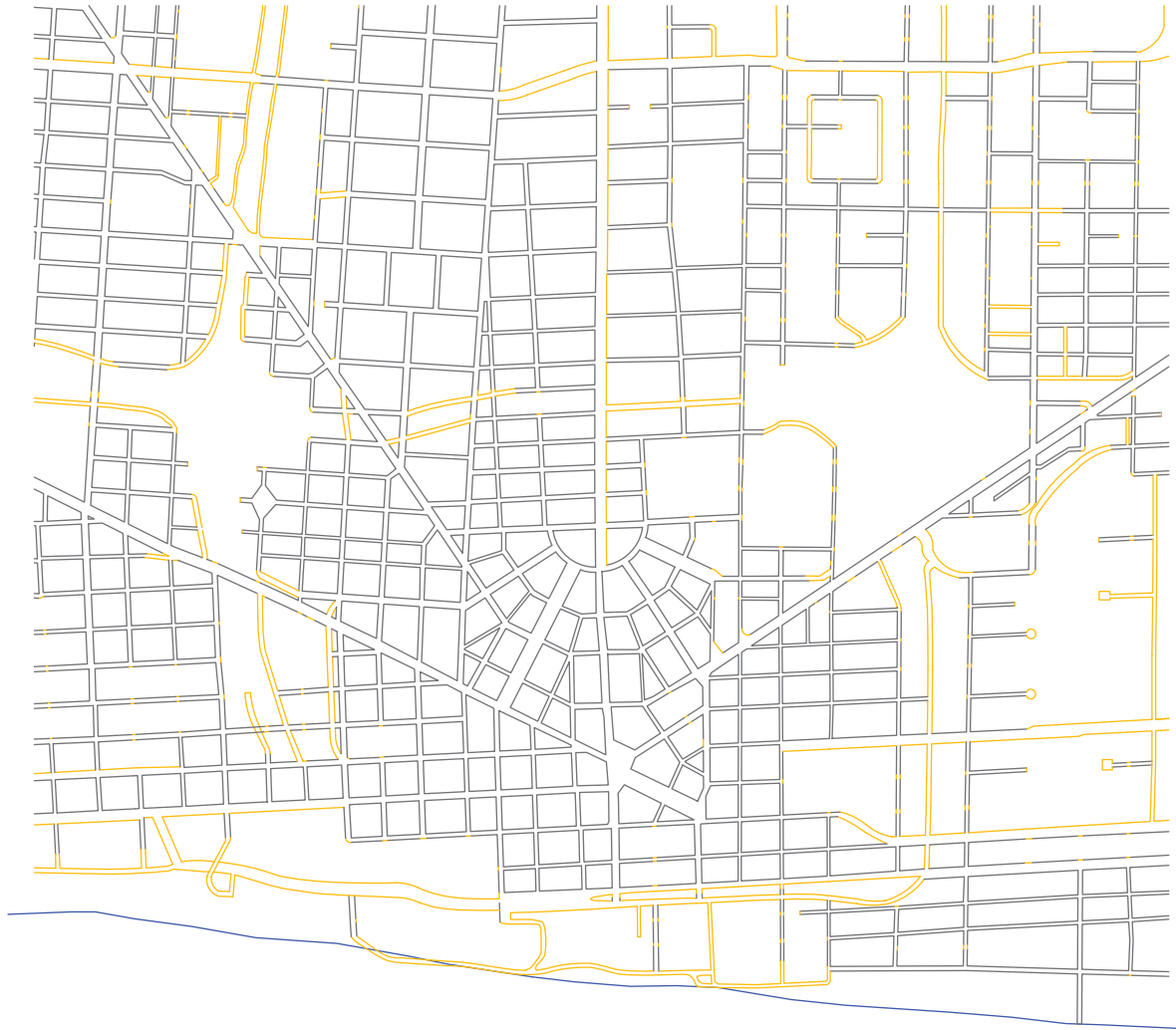
Figure 2. By 2002, downtown Detroit had been substantially restructured. Many streets were removed, making much larger blocks. New streets were wider and many connected to or bordered limited-access freeways (autoroutes). New block edges are shown in colour.