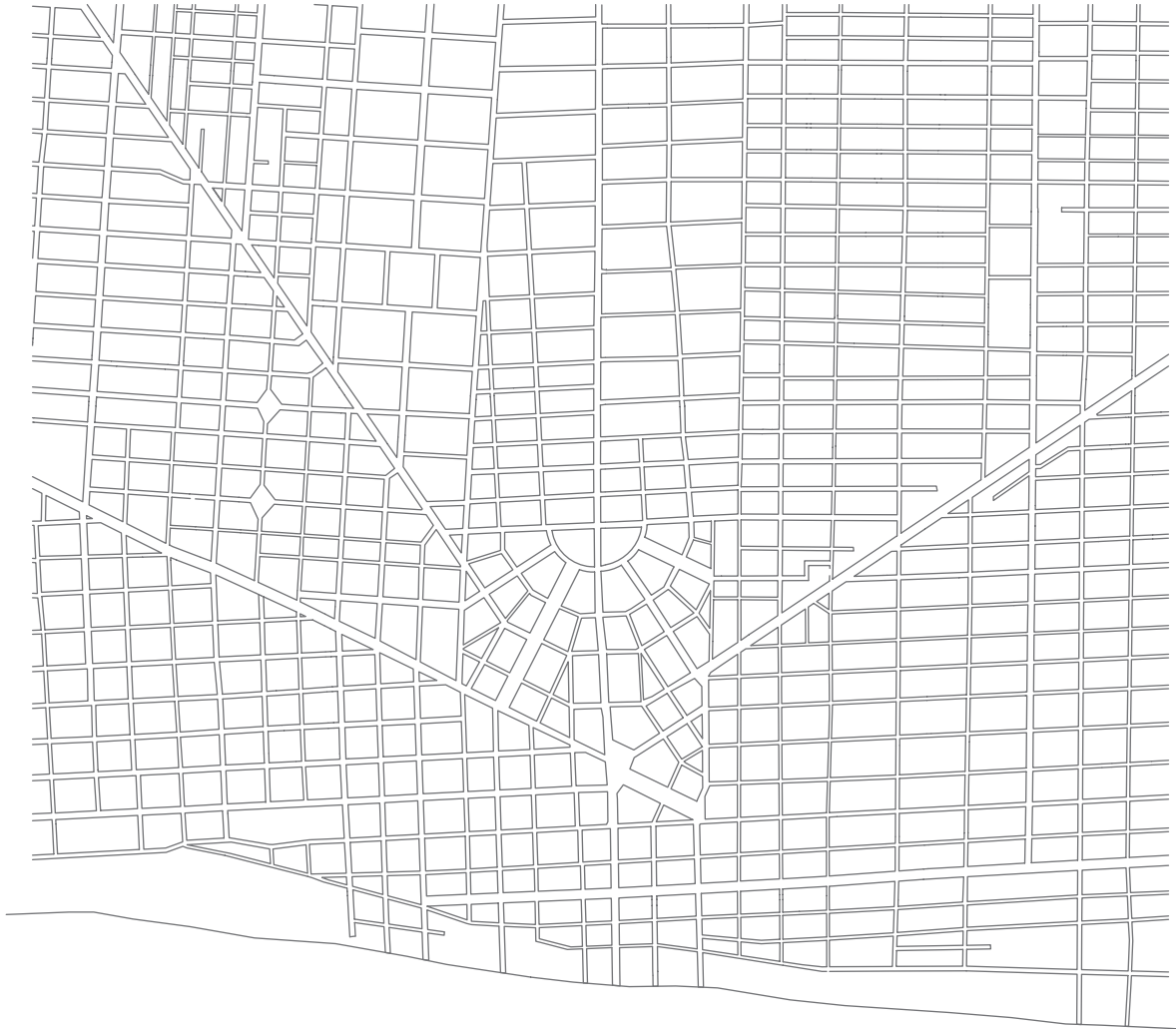
Figure 1. In 1896, the form of downtown Detroit was a loose rectilinear street grid with remnants of an older Baroque-inspired plan at its centre. The area shown is 2 miles by 2 miles or 3.2 km by 3.2 km.

(non-highway-related street widening and realignments); (4) 'megaprojects' (large, single-purpose buildings such as stadiums); and (5) miscellaneous (causes not apparent from maps). The causes of miscellaneous changes were subsequently identified by field inspection. Observing changes in the field identified the causes of miscellaneous changes (Table 2).