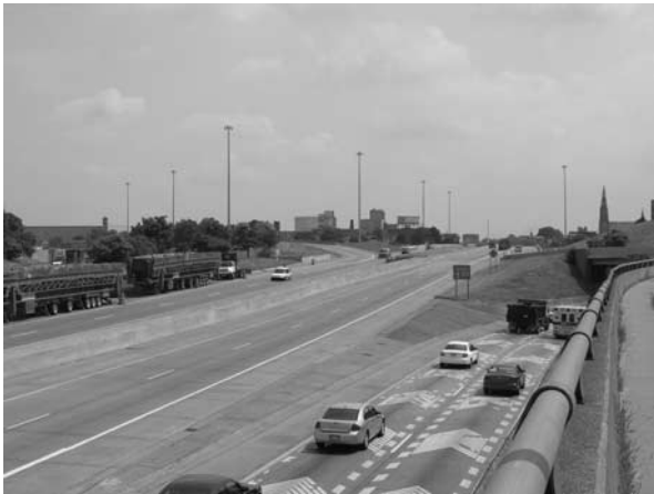
Figure 7. Highway interchanges (here, the intersection of the Chrysler and Fisher freeways) constructed directly adjacent to downtown Detroit consumed immense amounts of space previously occupied by small-scale fabric and city blocks.