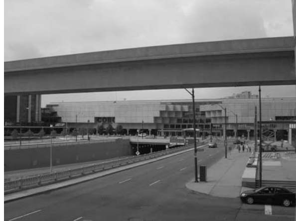
Figure 8. Gargantuan single buildings, or megaprojects, similarly consolidated many smaller city blocks.