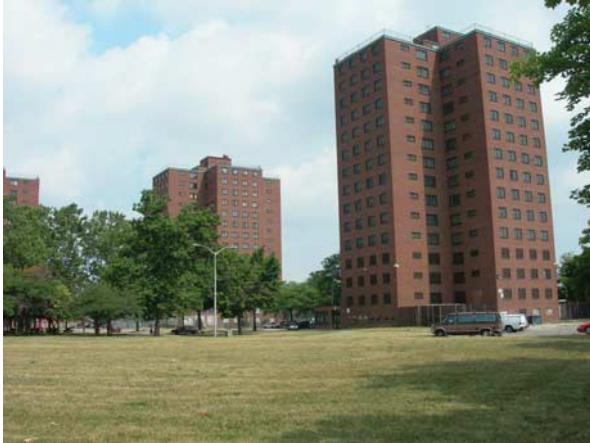
Figure 6. Many older blocks were cleared and consolidated for urban renewal programmes such as this public housing directly north of downtown Detroit.